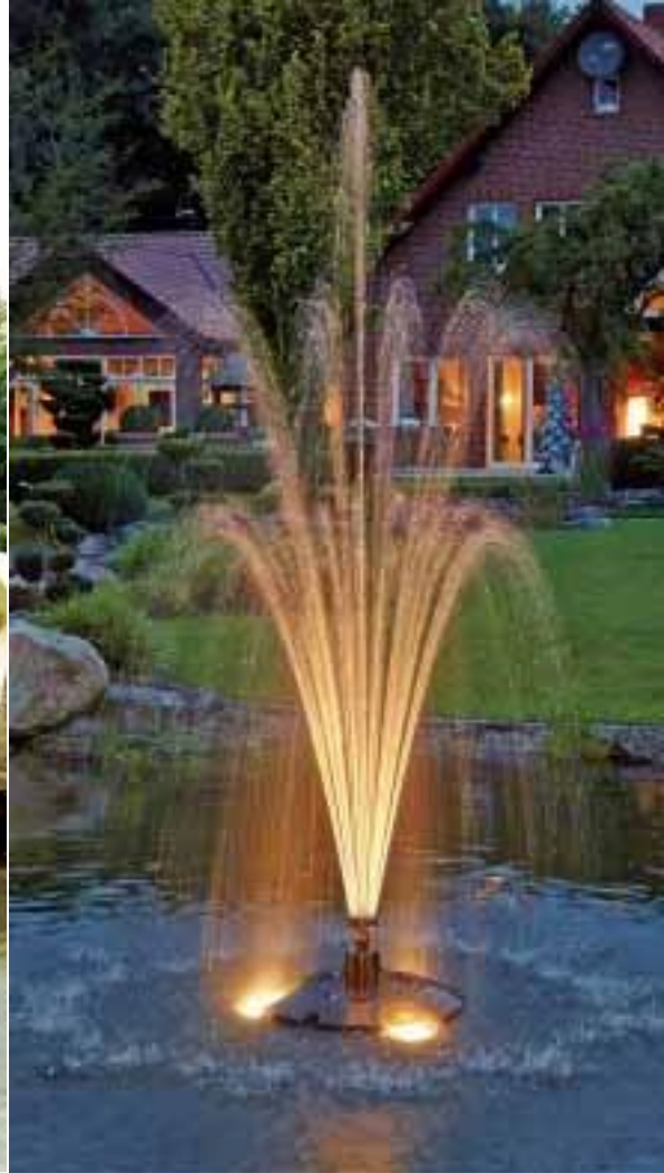
Application examples: PondJet with PondJet nozzle